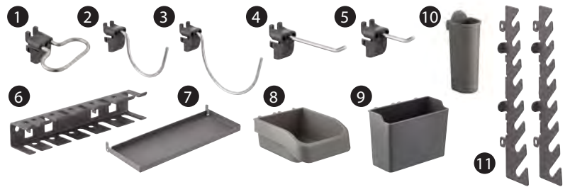
1. Oval hook 2. Small round hook 3. Large round hook 4. Long straight hook 5. Short straight hook 6. Multi-tool holder 7. Shelf 8. Short bin 9. Tall bin 10. Cup 11. Wrench holder