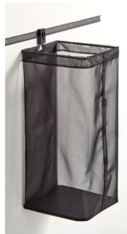
SQUARE MESH STORAGE BAG