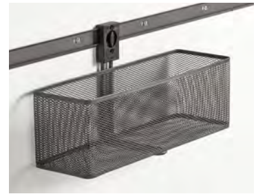
TRACK MESH BASKET